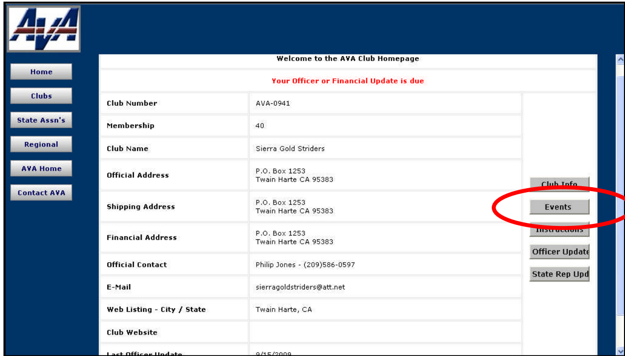
Figure 1 - Club Home Page