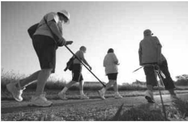
Members of the American Volkssport Association participated Wednesday in 5K, 10K and 17K walks at White Rock Lake during their biennial convention. The word volkssport is German and literally means 'people's sports.'