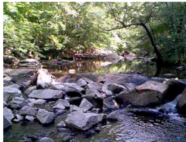
Enjoy a great walk beside bucolic Holmes Run.

One 10-KM (6.2-mile) walk trail will be available with a shorter 5-KM (3.1-mile) option. Full walk trail is rated 2 (mostly flat with moderate hills). One IVV credit stamp. This will be the WDCAVC's 165th international volksmarch.