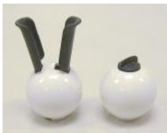
The salt shaker and pepper mill above appeared at one of our walks and they need to return home. If these are yours please contact someone at the food table at the next walk!