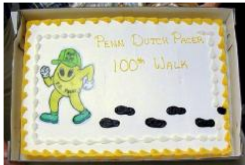
P D Pacer adorned the celebratory cake which was available for all participants in Lititz. December marked the 20 year Anniversary of the founding of the Penn Dutch Pacers.

Thanks to everyone that contributed in any way especially all those who showed up to volunteer at the startpoint and all the checkpoints despite the weather.