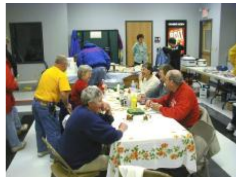
Folks enjoyed some great PDP food inside the Lititz Community Center where it was warm and dry which was a far cry from what it was like outside!

The beginning of the week the Sunday weather looked relatively promising, but as the weekend approached all the forecasts seemed to favor 100% rain with possible snow and freezing rain as well.