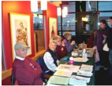
Our wonderful hosts at Isaac's provided space for us opposite the Pickle Bar at the back of the restaurant

Thanks to everyone who helped with the production of this event as well as all of you who joined us from all over to make this a whopping success!