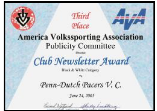
The publication that you are reading won the Third Place Award for Black & White Newsletters at the recent AVA Convention Held in Cherry Hill, NJ.

Thanks in advance for your contributions and we look forward to seeing you at our first walk for 2006 in Quarryville.