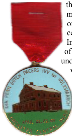
This medal was awarded at PDP's very 1st event.

teers over these two decades that produced 103 weekend events and countless YRE and seasonal walking opportunities. It is with the work of all these people in mind that we celebrate the past 20 years and look forward to many more. Please come out either Saturday, June 27th or Sunday, June 28th or both and walk with us to celebrate and then have a bit of celebratory cake. In these pages we try to give you some background of the area in which we will be walking so that you can understand the area over and above what you experience on the