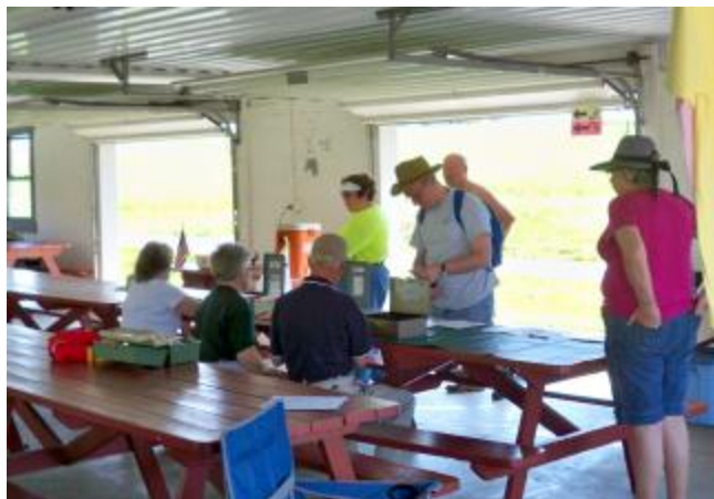
The Finish table is a busy place at the end of the day as folks get back.

Spectacular, Hot, Sunny, Unseasonably Warm, Uncharacteristic.... these are all adjectives that aptly describe the experience at our second walk of the year in Brownstown. If you are at all familiar with our Spring walks you know that all those adjectives are very un-typical of the weather that we experience at our annual Spring walk where you can usually use one word to describe the weather, monsoon.