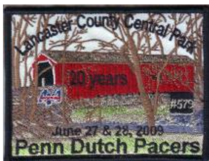
This is our 20th Anniversary Patch showing the Covered Bridge in the Park