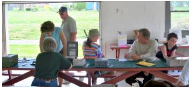
Kibitzing on Sunday near the end of the walk.