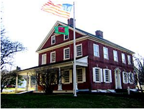
Rock Ford - The Home of General Edward Hand

Bordered by woods to the south and lawn to the north, the Garden of Five Senses sits on a hill overlooking the Conestoga River. The garden is open to the public all year round.