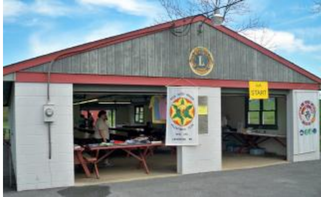
Our Start/Finish location in West Earl Park.