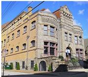
This is the first Carnegie Library in Braddock PA

The Holy Family Walkers of Lawton, Oklahoma are proposing this Special Event. From the late 1800's to the early 1900's