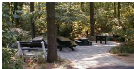
Garden of the Five Senses

Ironically the history of the Lancaster County Central Park is also intertwined with the Lancaster Area Refuse Authority which began in 1954 when the city of Lancaster and several surrounding municipalities formed the Authority, better known as LARA. During these years, LARA operat-