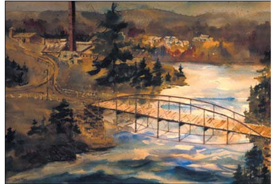
Bow Bridge-early 1900's (Painting by Tom Ryan)