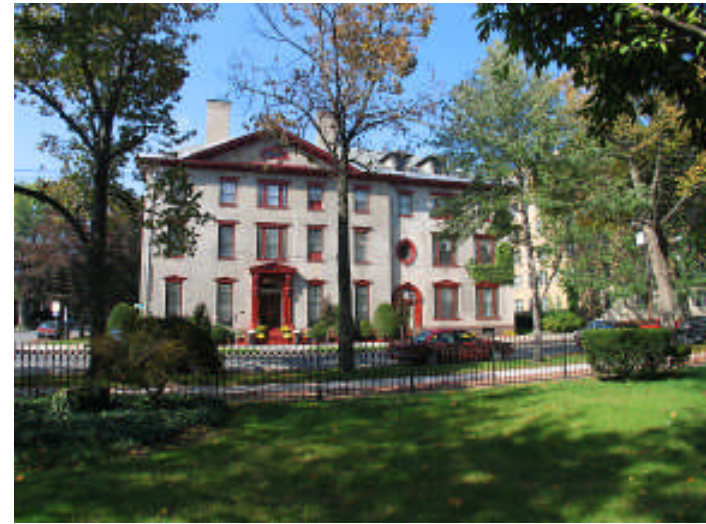
The Stockade Inn